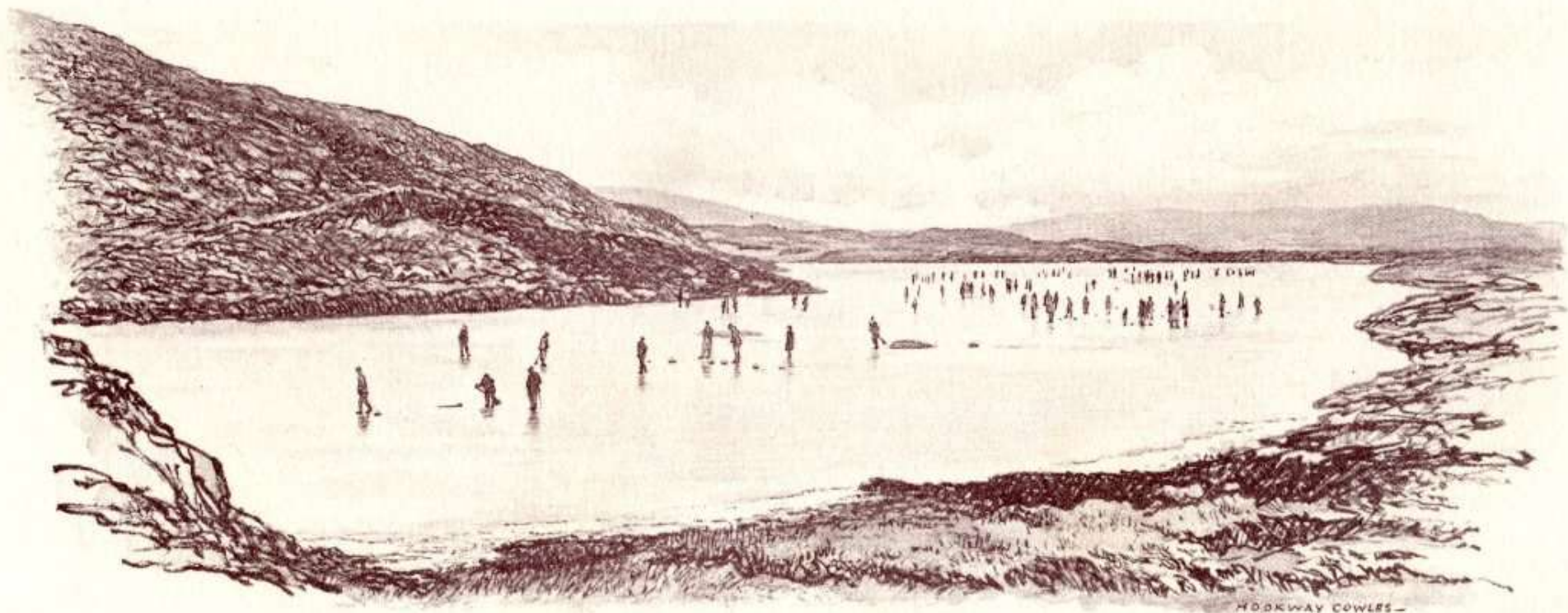
SIX PARISH CUP ON LOCH CORBIE, GATEHOUSE-OF-FLEET, 1930 (THE LOCH VANISHED LATER THAT SAME YEAR)