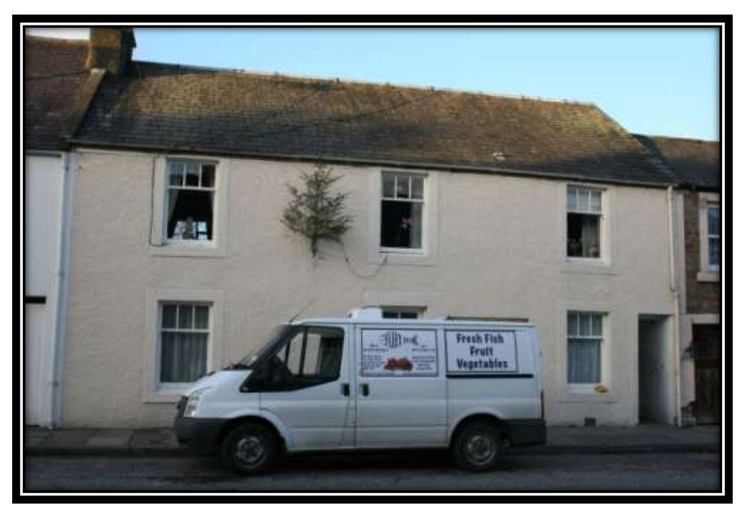
15 & 13 Fleet Street

This building occupies a double plot, and the numbers allocated to it are 13 and 15. At some time, probably in the 1950s the property was divided into two halves, an upper and a lower flat, each occupying the full width of the double plot. Since then the lower floor has been referred to as 15A and the upper floor as 15B. No.13 does not exist.