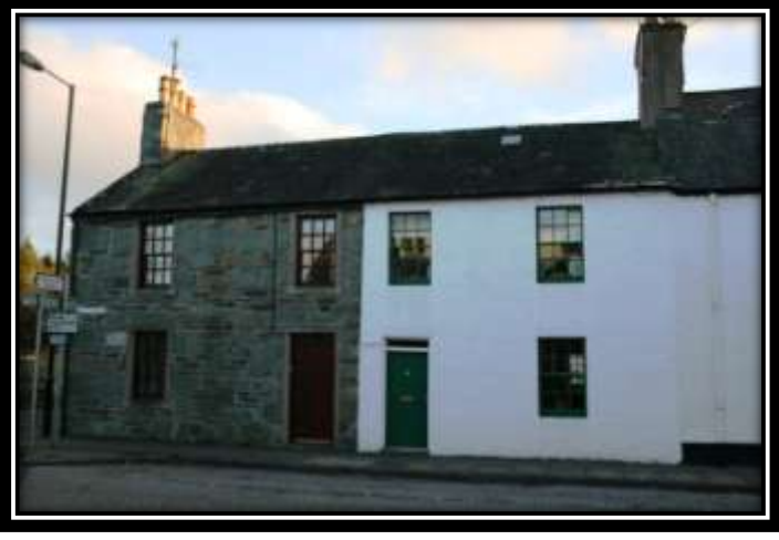
Nos. 2 & 4 Fleet Street