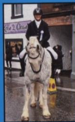
Fleet Lad 2025 GORDON NICOL