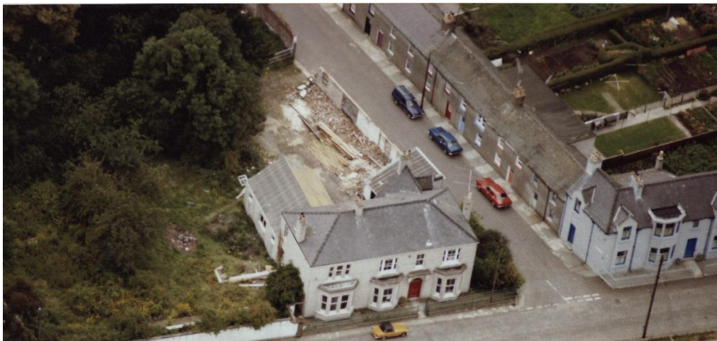
Junction of Castramont Road & Birtwhistle Street – left is Woodlyn , right is East View .

Woodlyn was built in 1877 and involved knocking down some Birtwhistle Street houses and reusing others as stables and stores. When Birtwhistle Gardens was built, these outhouses were demolished. Woodlyn was used as Girthon Manse between 1945 and 1977.