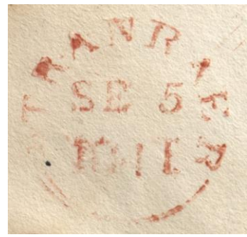
Pre-payment stamp Of Stranraer