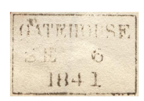
Receiving stamp of Gatehouse