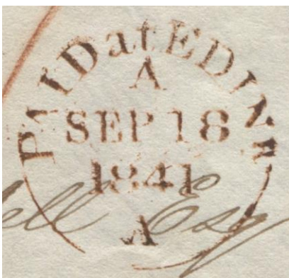
Pre-payment stamp of Edinburgh