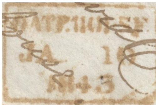
Collection stamp of Gatehouse