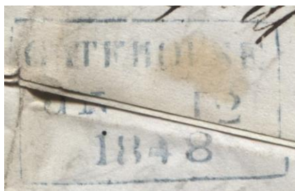
Receipt stamp of Gatehouse