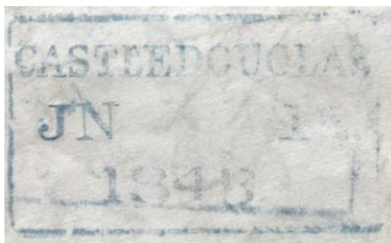
Collection stamp of Castle Douglas