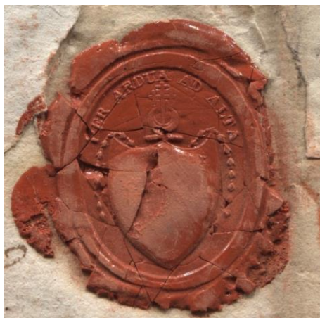
Hannay seal "per ardua ad alta"