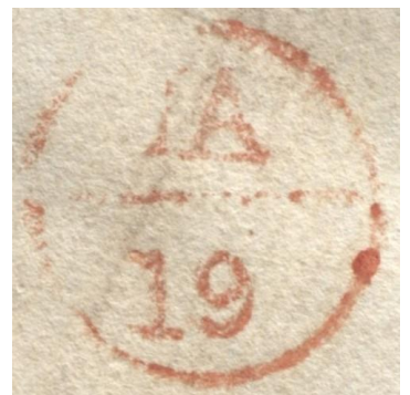
Edinburgh receipt stamp 19 Jan