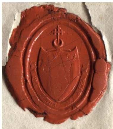
Hannay seal "per ardua ad alta"