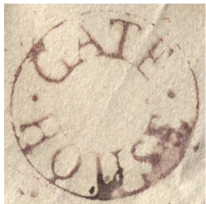
Gatehouse receiving mark