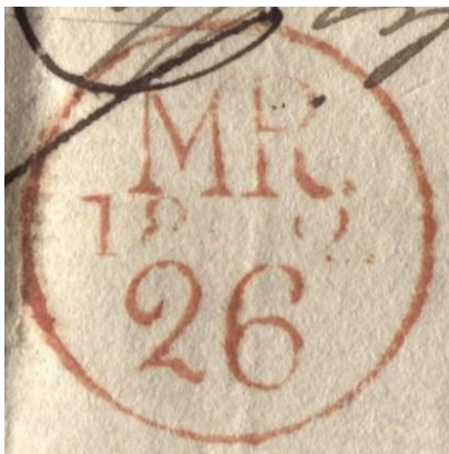
"Bishop" mark for 26 th March