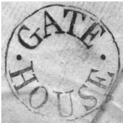
Gatehouse collection stamp