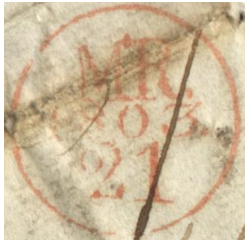
Edinburgh receipt stamp March 21 st 1803