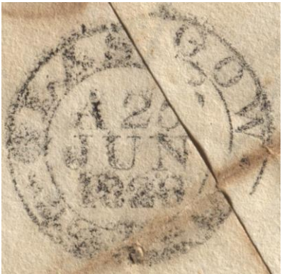
Glasgow receipt stamp