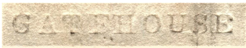
Gatehouse collection stamp