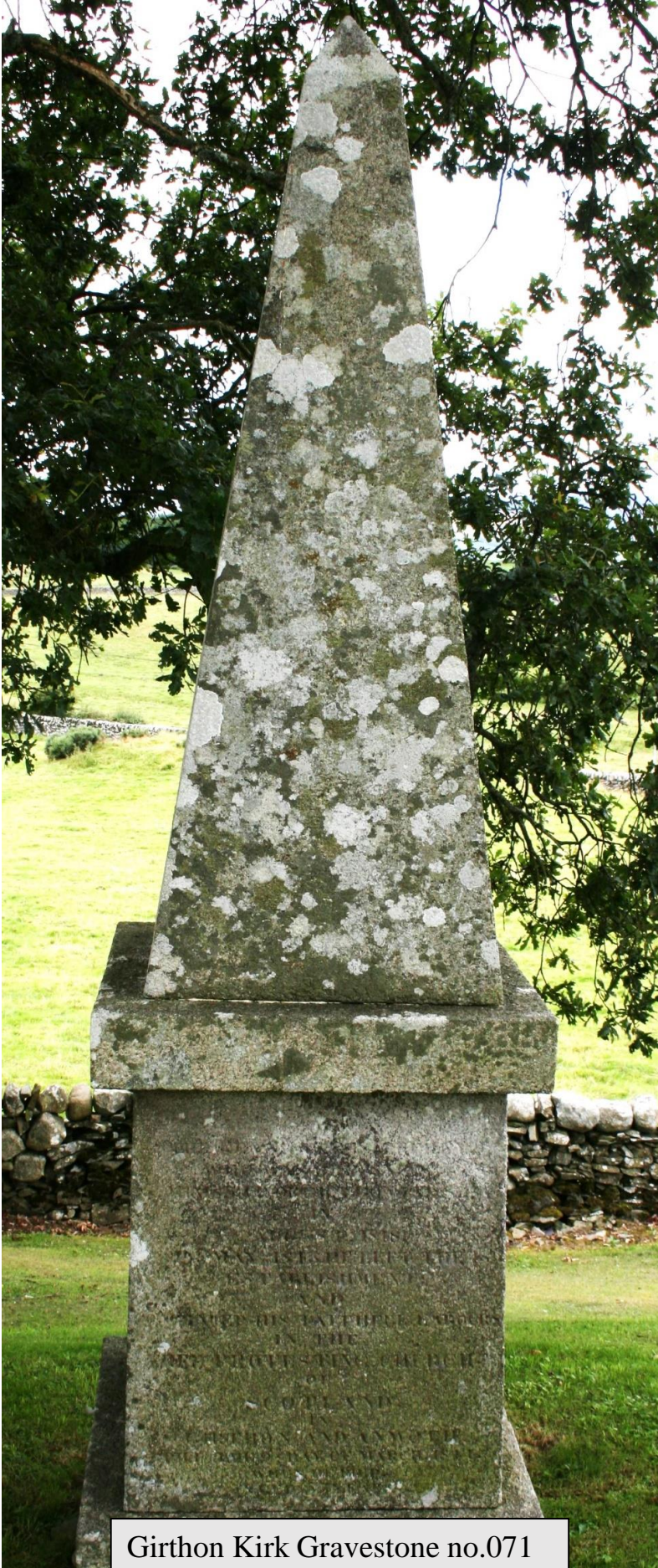
Girthon Kirk Gravestone no.071