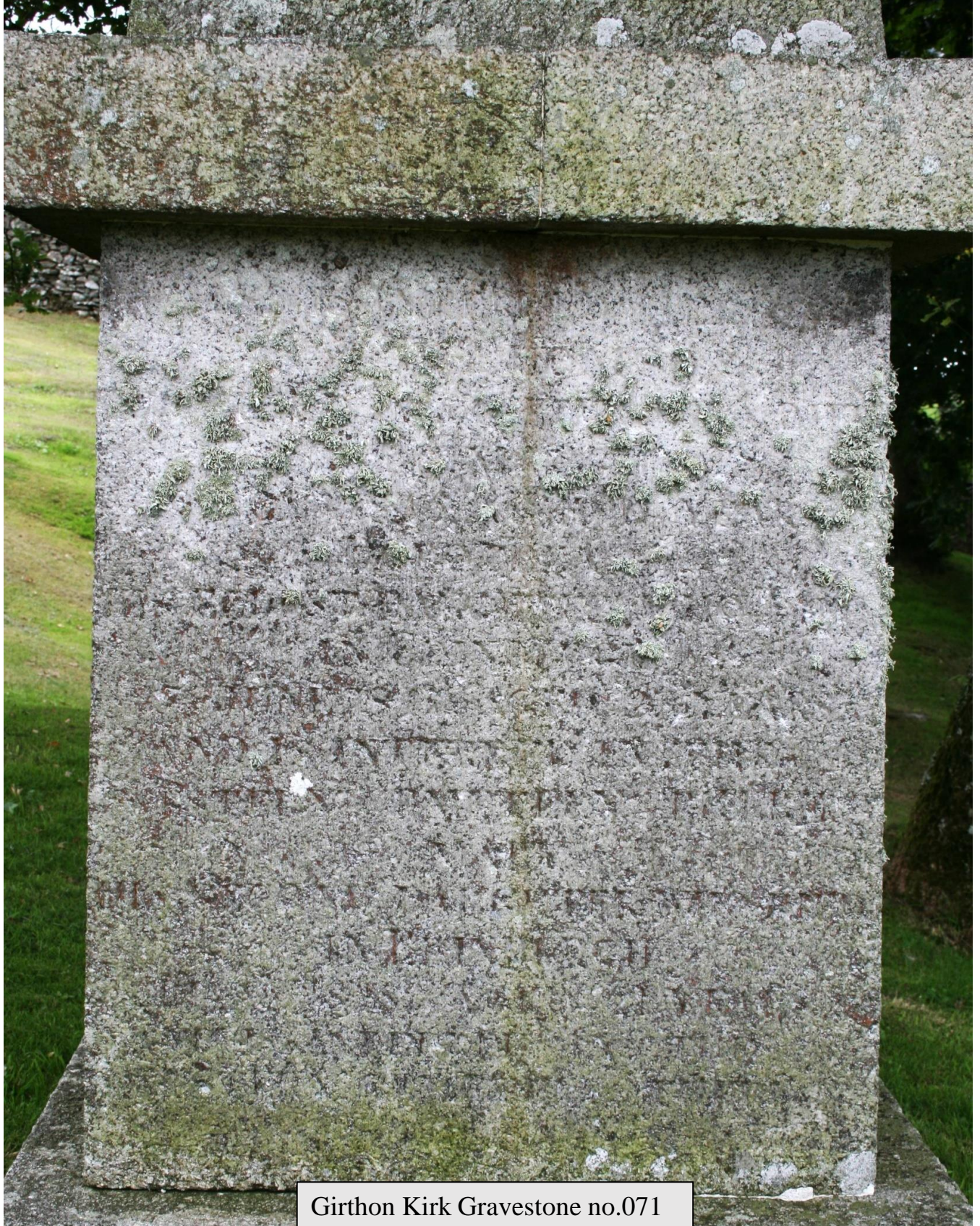
Girthon Kirk Gravestone no.071