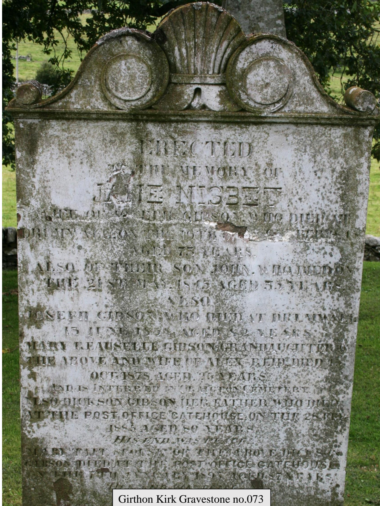
Girthon Kirk Gravestone no.073