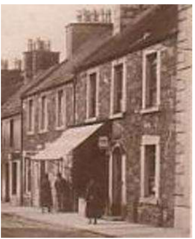
No. 5(with canopy) & No.3 High St.