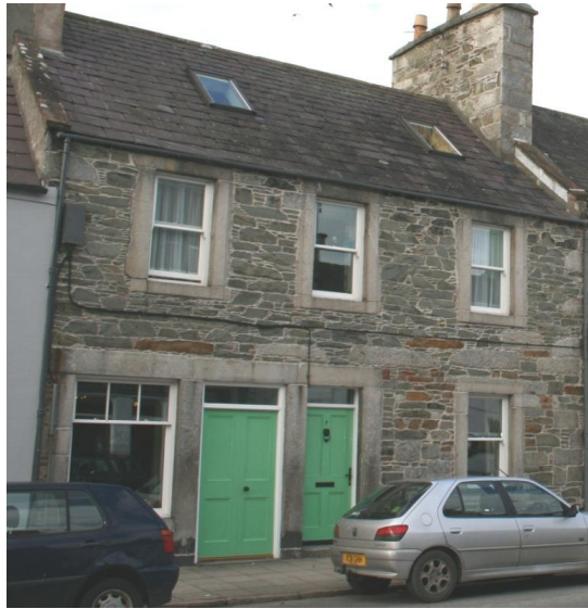
Nos. 9 & 7 High Street

For many years, 9 High Street was the site of the Stewartry Dairy and later Fleet Farm Dairy .