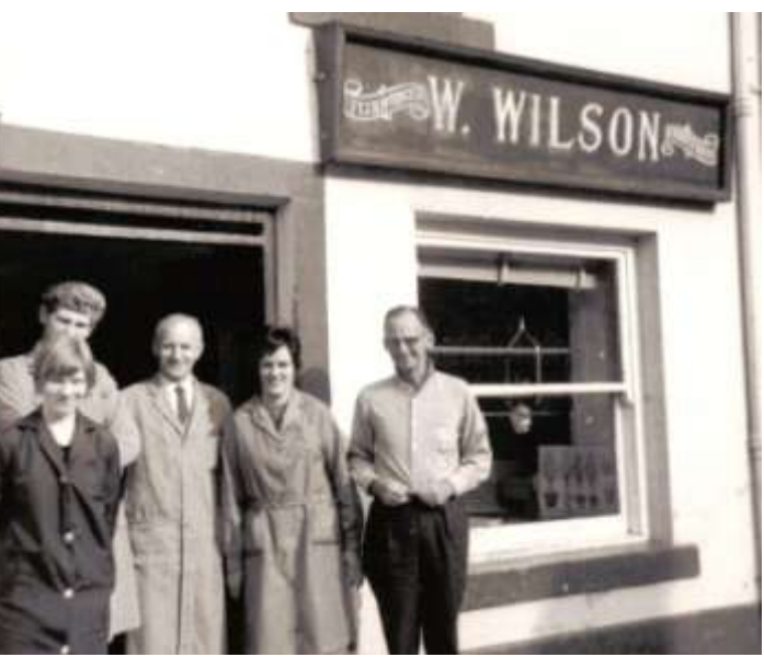
37 to 27 High StreetWilson Fishmonger's at 31 High Street