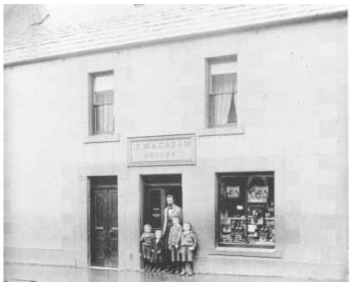
Door to 51 + Shop @ 49 High St. (c.1905?)

For many years no.49 was Macadam's grocer's shop. It is now a charity shop.