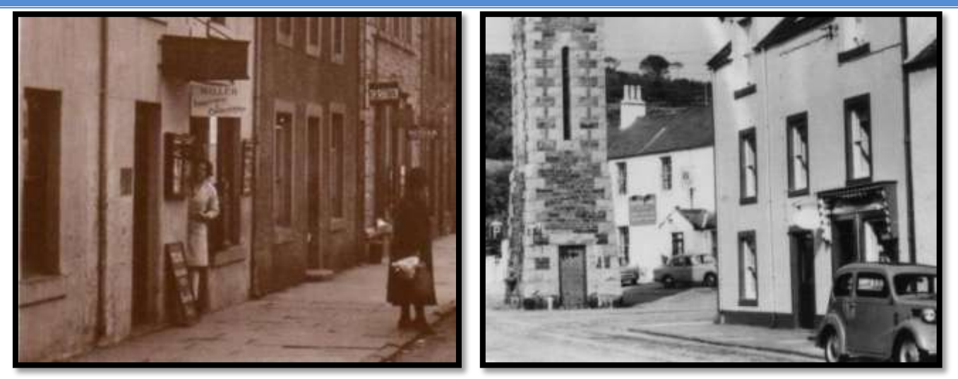
<u>Top L</u> : Shop (no.4) has its own doorway <u>Top R</u> : Shop has canopy over doorway and window.