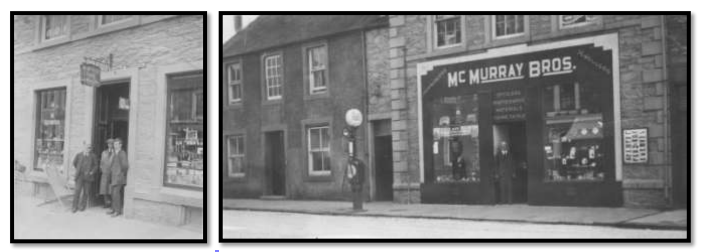
McMurray Bros. at 8-10 High Street before and after the integrated shop front was added.