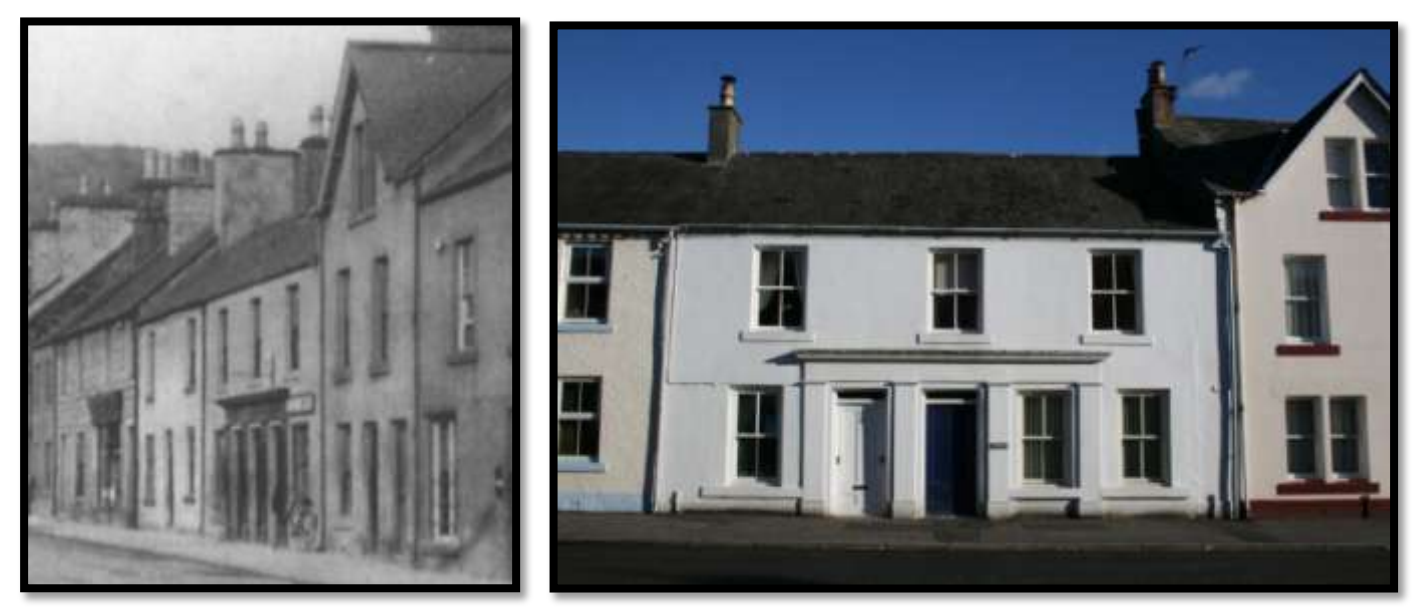
The picture on the left (from an old PC) clearly shows 3 doorways under the canopy (these were nos. 24, 26 & 28). The photos of Galloway Lodge below show only 1 door, whilst the above photo taken in 2013 of the conversion back to residential property has 2 doors (for 24 & 26 High Street). 28 High St. no longer exists.