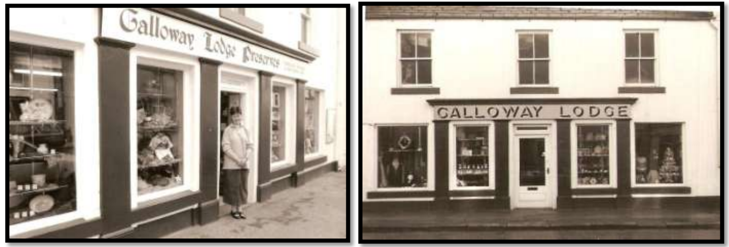
Fiona Hesketh outside Galloway Lodge Preserves