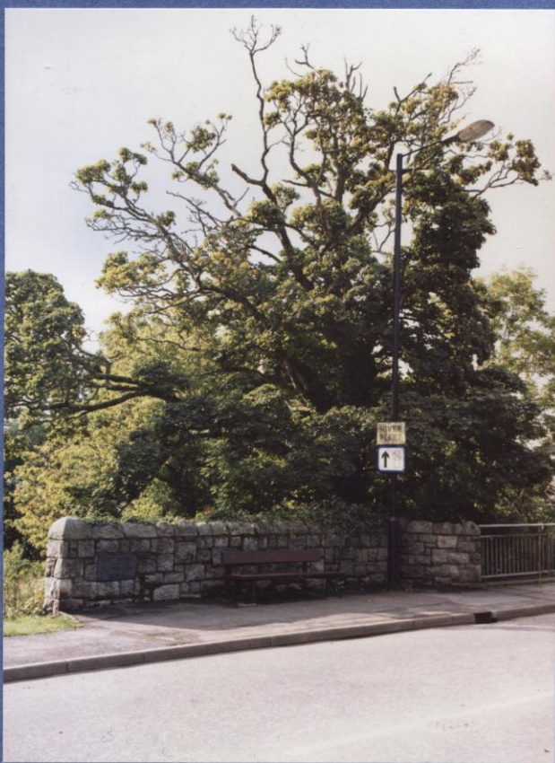
The Work Place by the bridge over the River Fleet