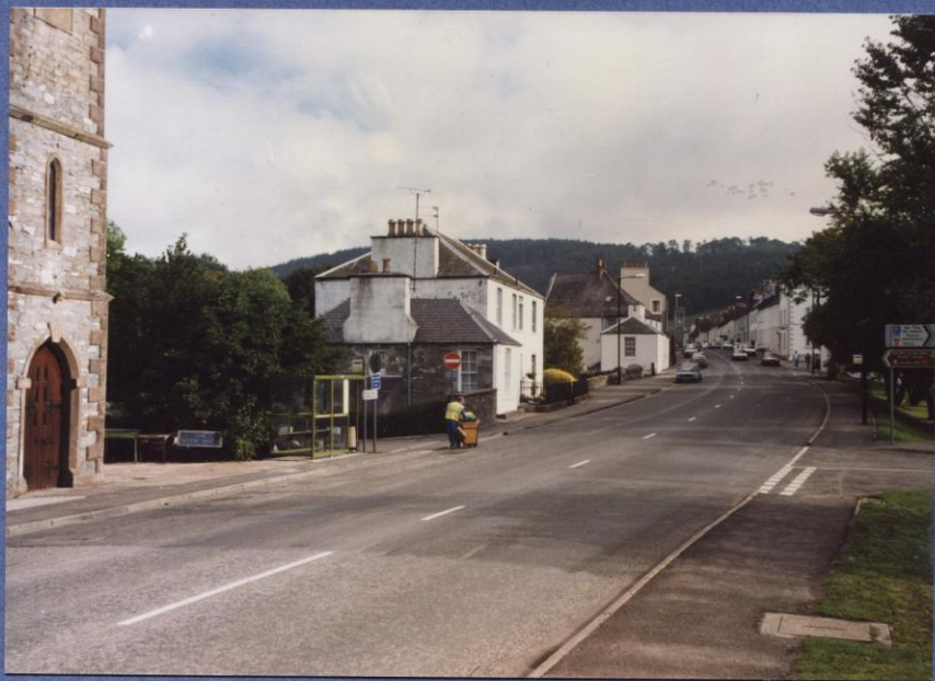
Gatehouse in 1995 The view painted on June 24th 1995