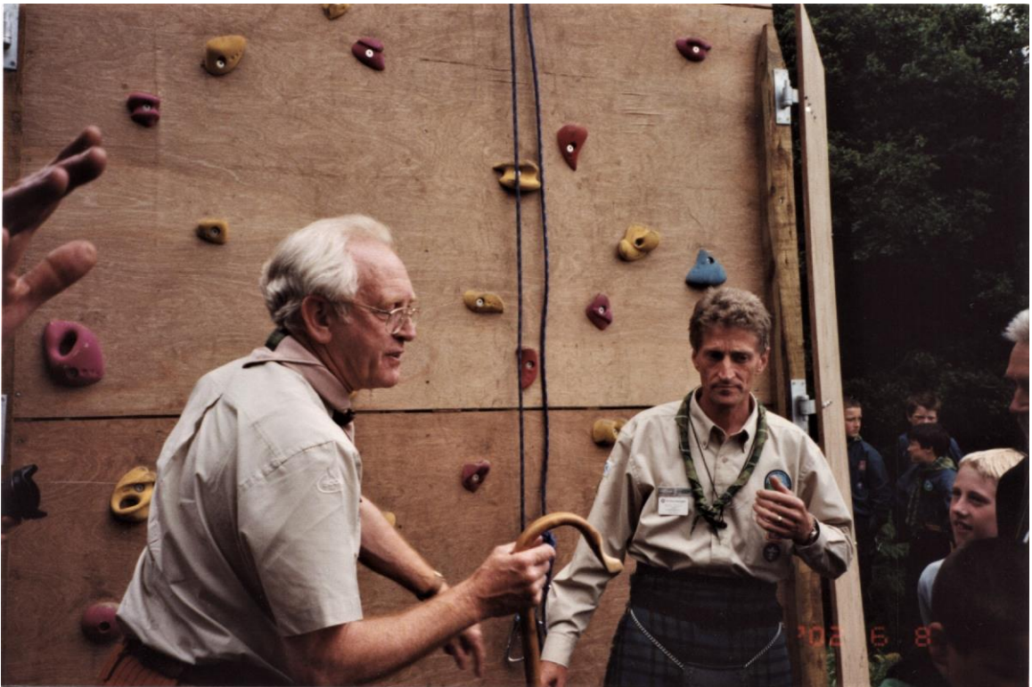
Chief Scout prepares to open The Climbing Wall