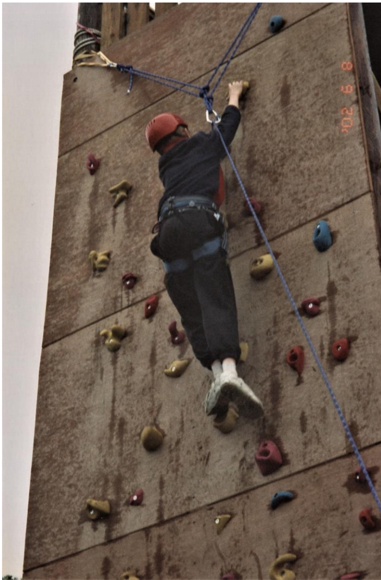
Demonstration of climbing skills