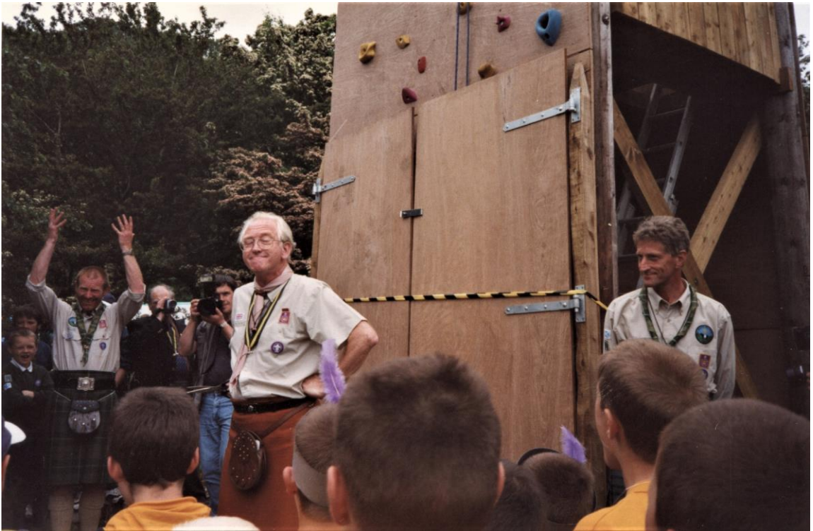
Chief Scout formally opens The Climbing Wall