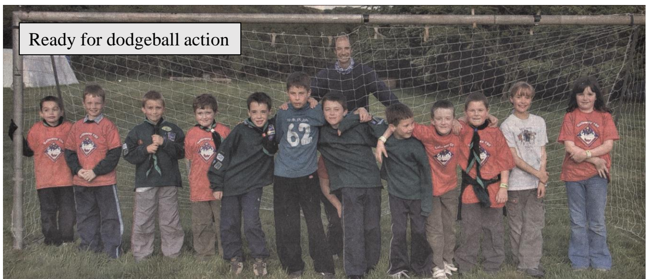
Ready for dodgeball action