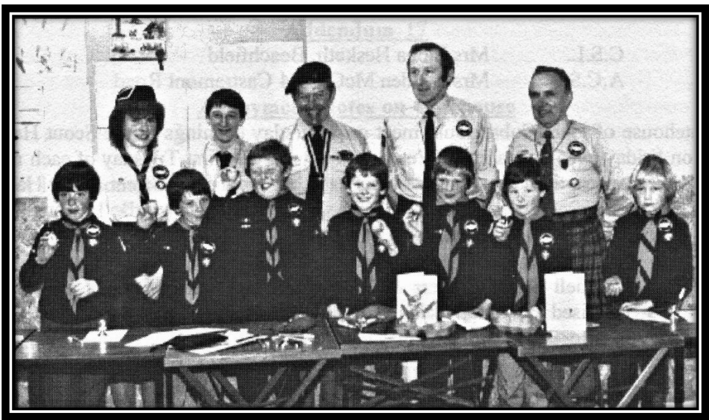
The 1 st Gatehouse of Fleet Cubs with the Chief Scout