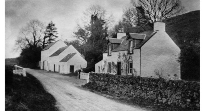
Barlay Mill & Miln of Barlay, Laurieston Road, Gatehouse