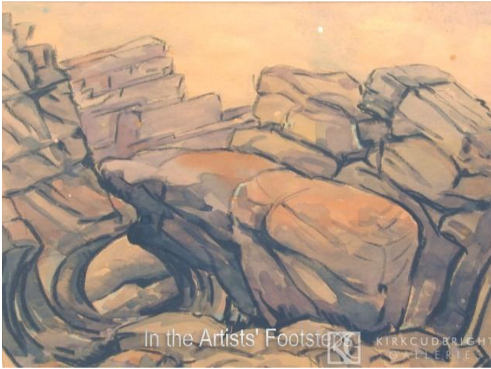
Rock Formation Ardwall Island