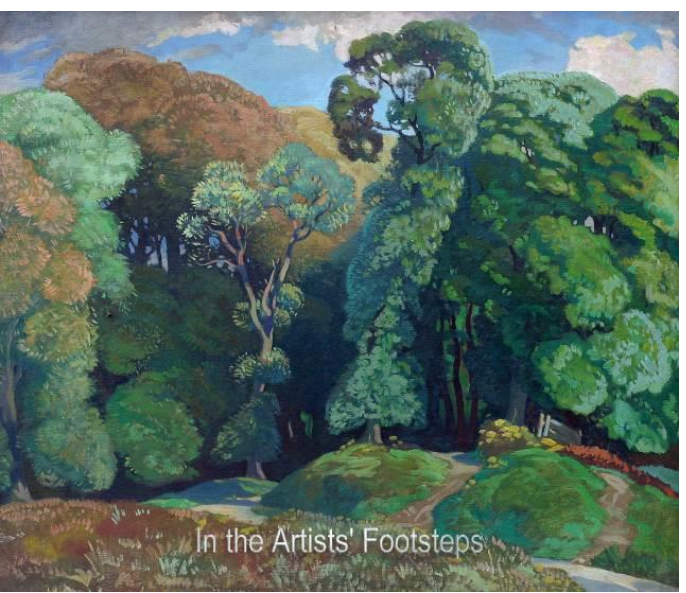
Boreland Wood, Gatehouse