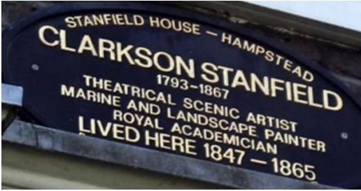
The plaque on his Hampstead residence doesn't help to clarify his real name.