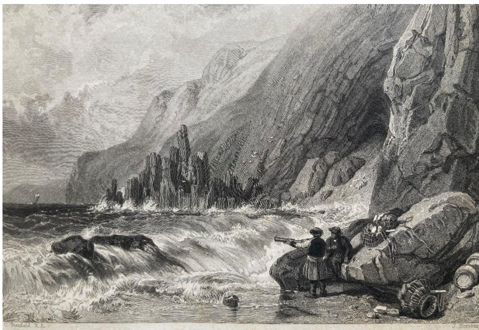
Dirk Hatteraick's Cave