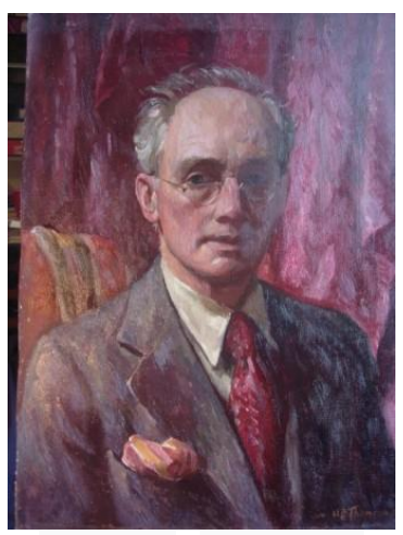
self portrait painted c1950