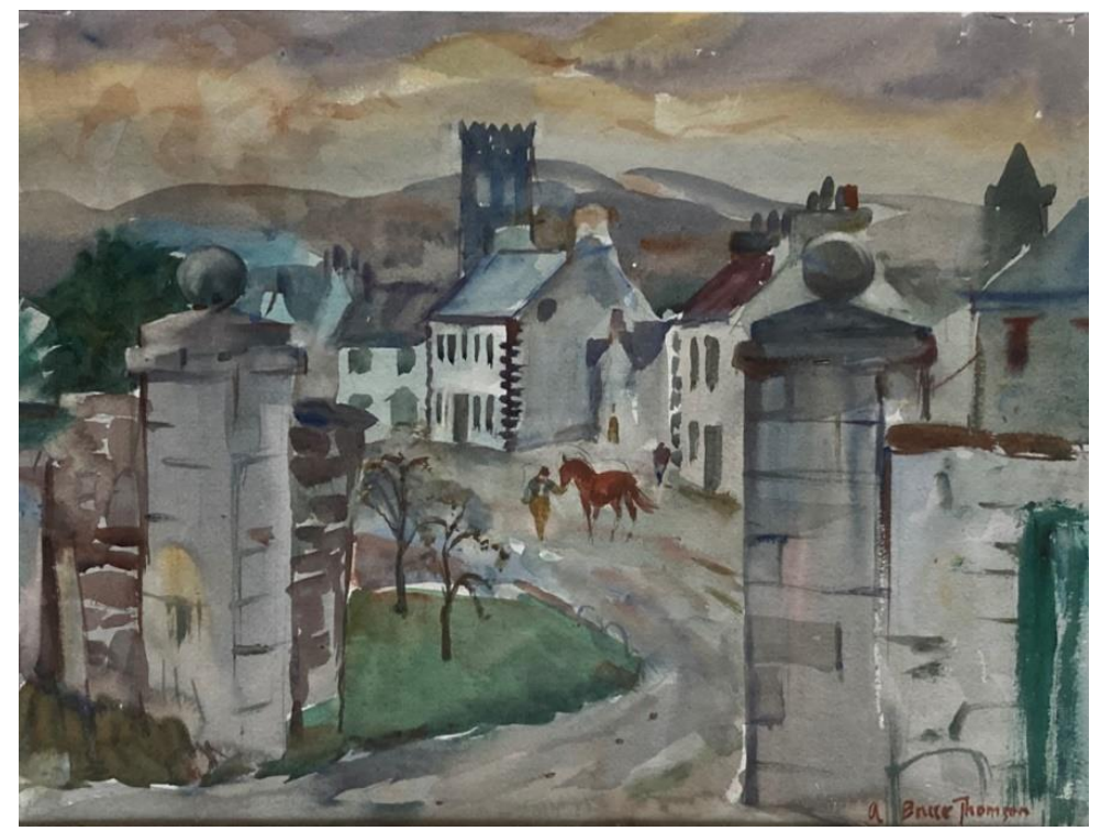
"Gatehouse of Fleet" Through the Park Gates at the top of Ann Street

The following examples of his work came from The Scottish Gallery website (link above)