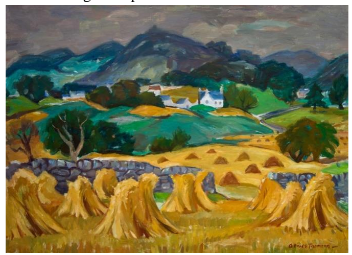
Harvesting in Galloway

The following examples of his work came from The Scottish Gallery website (link above)