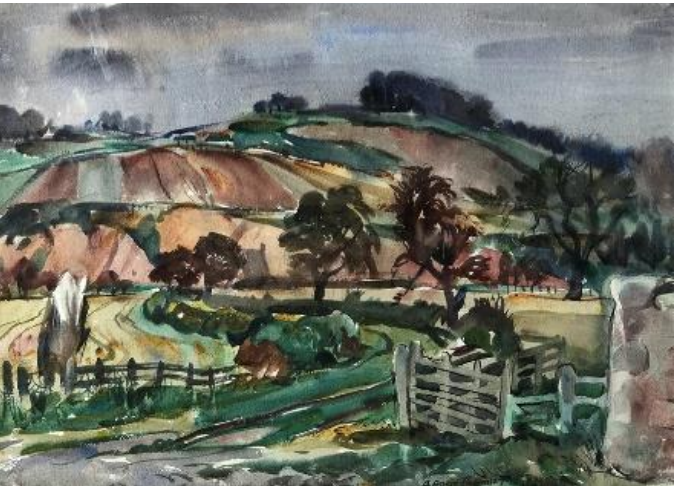
Borders Harvest c.1960 watercolour