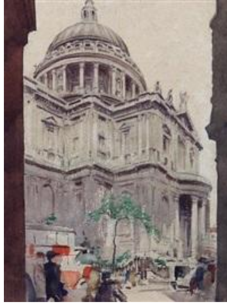
St. Paul's Cathedral

(ex Art Gallery of New South Wales in Australia)