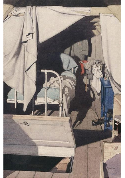
Bed in the Attic

Has been for sale on a number of websites