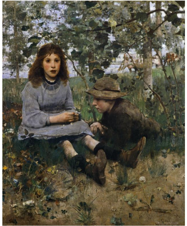
A Daydream (ex National Galleries Scotland)