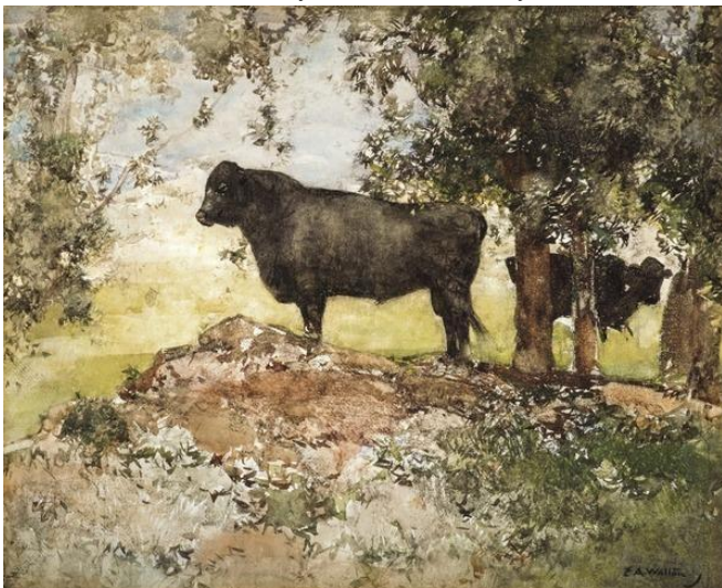
The Black Bull (ex National Galleries Scotland)