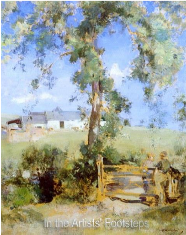
In the Artists' Footsteps