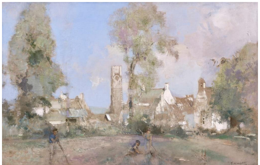
The Clocktower, Gatehouse of Fleet