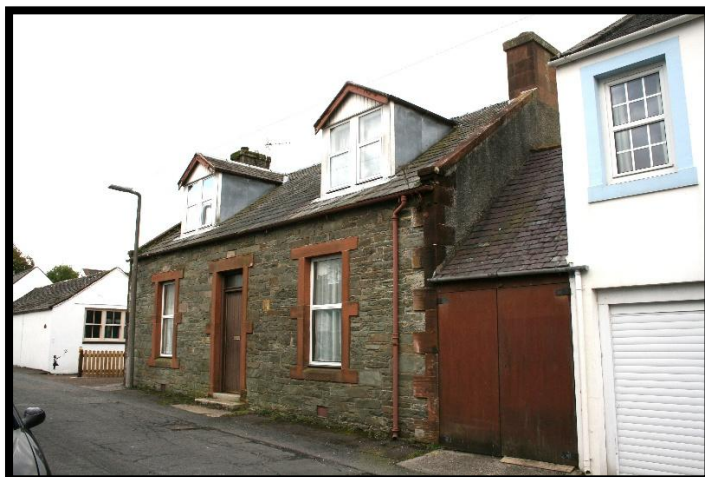
Gatehouse Police Station taken in 2016.

This was eventually closed and now there are no police buildings within Gatehouse of Fleet.