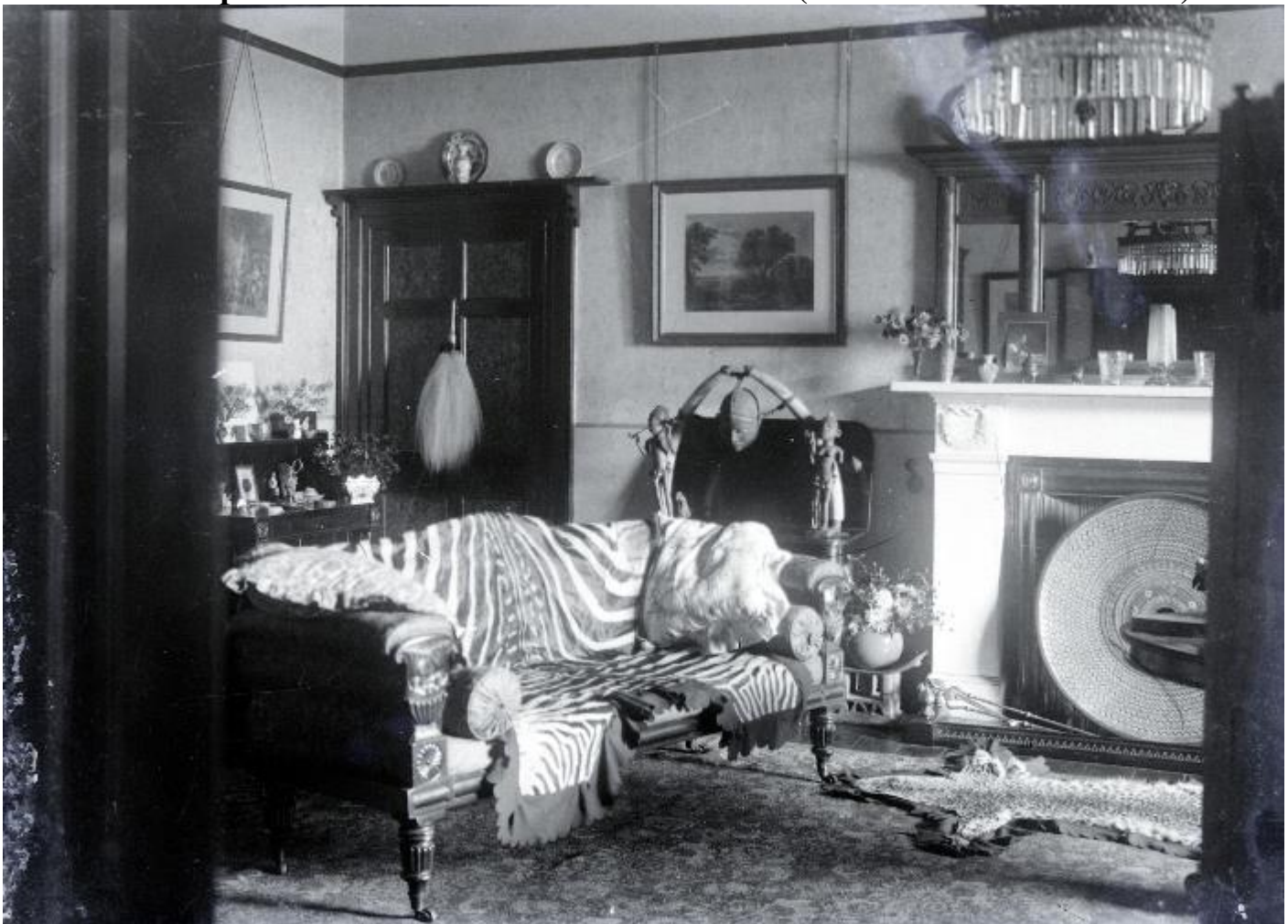
Here is a picture of one of the rooms at Roseville (note the African artefacts).