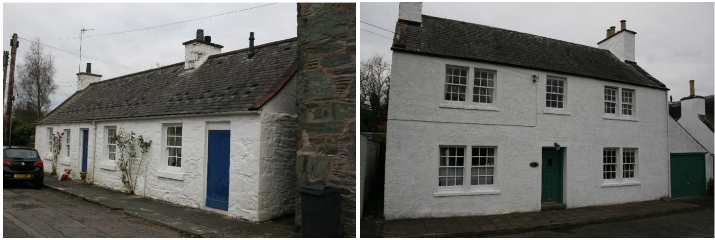
The upper photos are (1) no.3 Hannay Street & (2) no.6 Hannay Street (Clermiston Cottage). Below are no.8 Hannay Street (Victoria Cottage) and then the more modern Waterside.