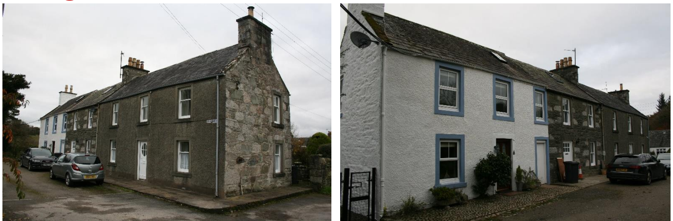
These photos were taken in 2017 and show a terrace of three 2-storey houses, numbered 3, 5 & 7 (east to west, right to left). No.3 was once 2 separate houses numbered 1 and 3, whilst no.7 has a pend entrance which could have been used as an alternative access during multiple occupancy.