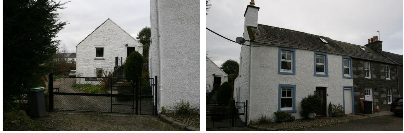
The building above left is the old tannery. Above right is no.7 Boatgreen showing the position of the pend door.