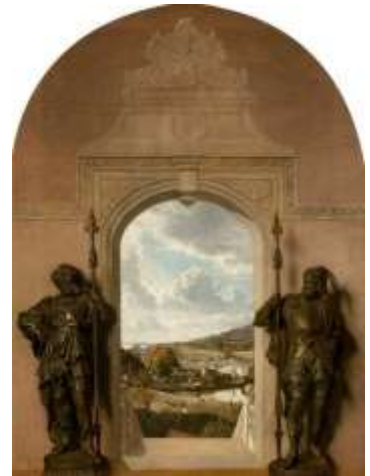
View over Gatehouse